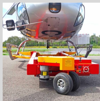
V920 Remote Control