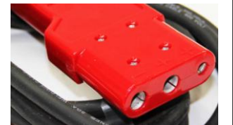
APU option (OPS)