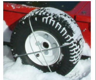
Winter Cables option