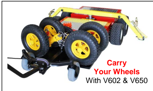
Carry Your Wheels With V602 & V650