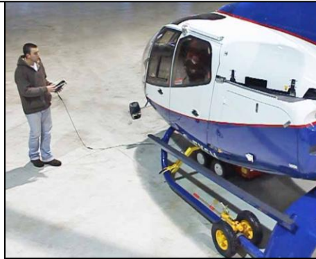
View Tail & Blades Easily