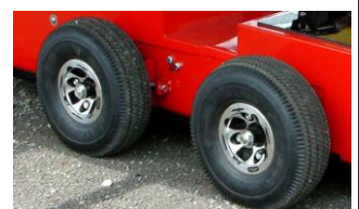
V610 for LOW height Same machine as V614 except with 10" (25cm) wheels Min. height for slide in: 11.25" (28.5cm)