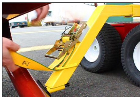
Easy Attachment Quick & Universal AT45