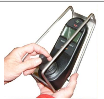
Easy Joystick V602 & V650 also offer foldable support arm