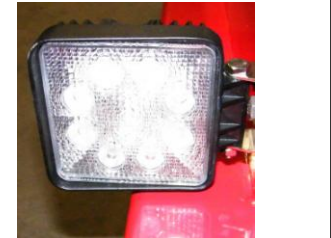
Lights Option (OLS)