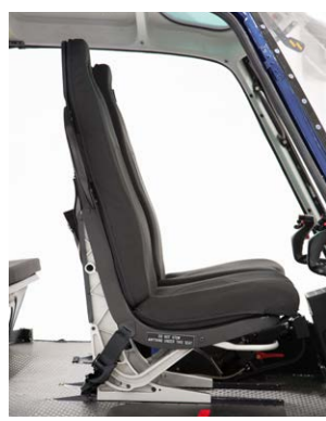
T3 - Standard Seat Thickness 3"